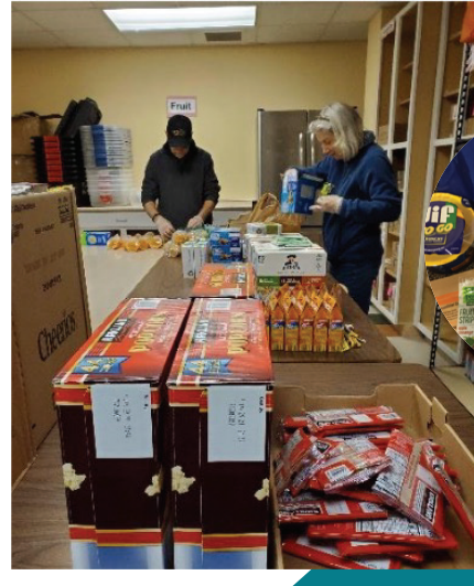
Volunteers Pack Bags for Food Program