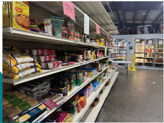
WayForward Resources Food Pantry