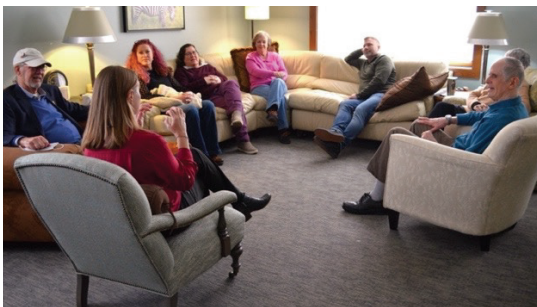
Gilda's Club Small Group