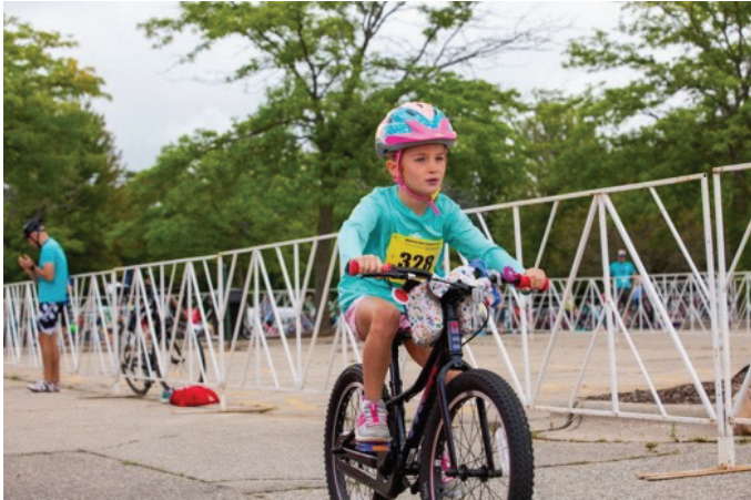
Tri 4 Schools